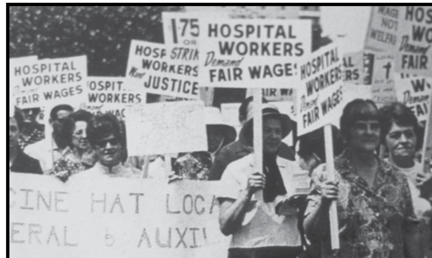
CUPE HEALTH CARE WORKERS, ALBERTA, 1970S

"No more the drudge and idler, 10 that toil where one reposes—but a sharing of life's glories: Bread and roses! Bread and roses!"