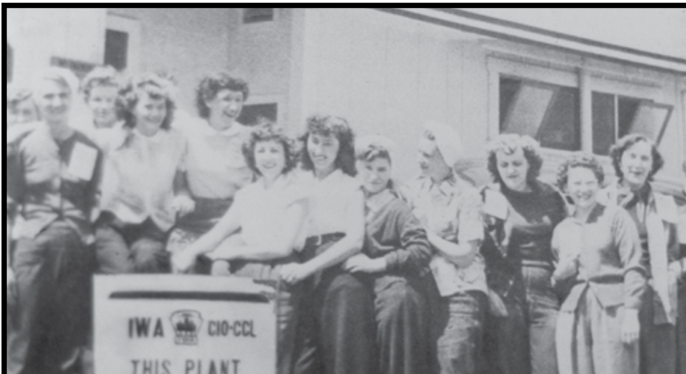
INTERNATIONAL WOODWORKERS STRIKE, B.C., 1952

in an industry like textiles with twice as many female workers as male.