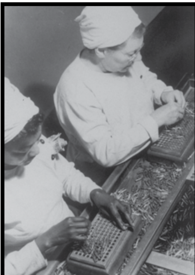
BULLET CANTING, SCARBOROUGH, ONTARIO, 1942 WWII