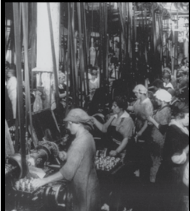
MUNITIONS PRODUCTION, WWII