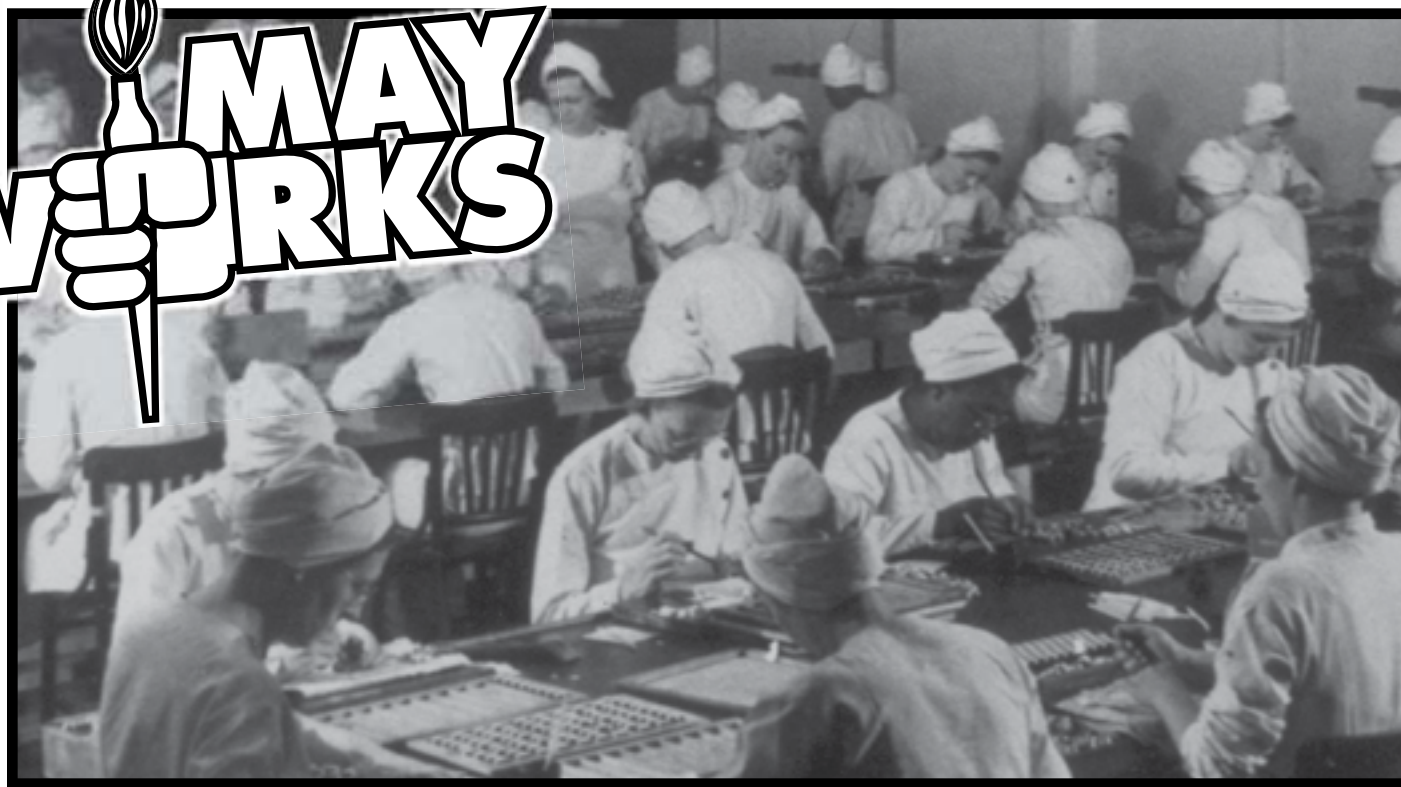
SCARBOROUGH WAR PLANT WWII