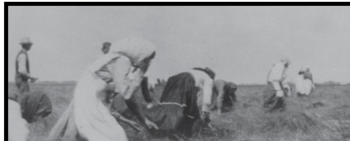
UKRAINIAN WOMEN REAPING WITH SICKLES, 1910

In 1912, the American Federation of Labor was a grouping of weak craft unions, made up of white men organized by trade. The AFL refused to organize Black workers. Until 1918, the federation barred women from membership—even