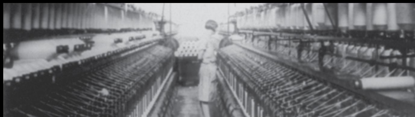
TENDING SPINNING MACHINE, VERDUN, 1929