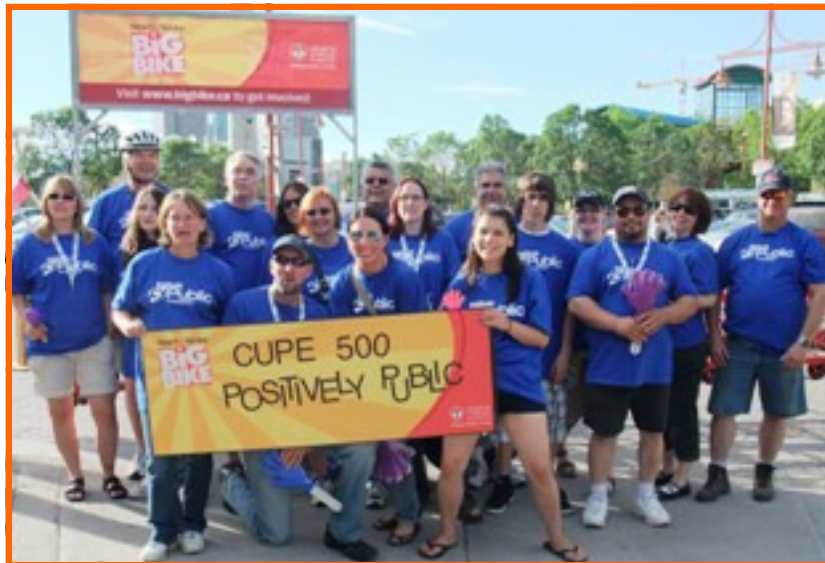
Local 500 "Positively Public" Big Bike Team 2010

We also continued to work closely with the Council of Civic Unions made up of the Presidents of all eight (8) civic unions/associations. We firmly believe it's extremely important that all civic employees remain united and work together on all issues of mutual concern.