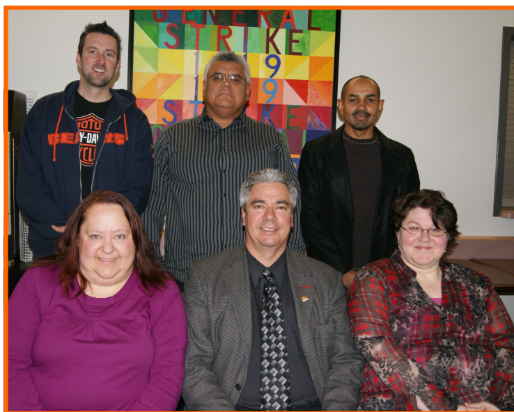
2011 Local 500 Table Officers and Trustee